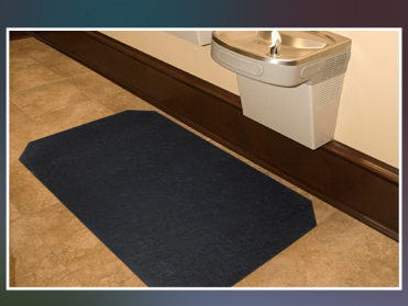
Sure Stride® (Adhesive-Back Matting)