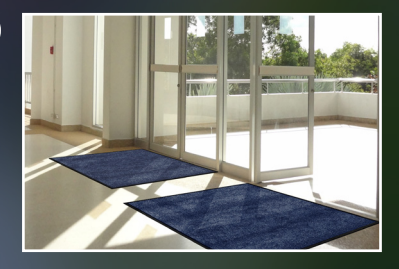
ColorStar® (PET fabric features 100% recycled content reclaimed from plastics)

www.mamatting.com 800.241.4696 (Dalton, GA) 800.241.5549 (LaGrange, GA)